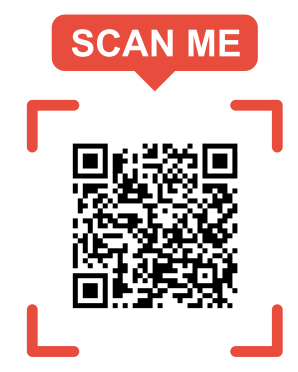
For more information